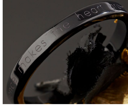
Personalising and engraving jewellery