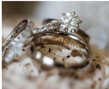
Personalising and engraving jewellery