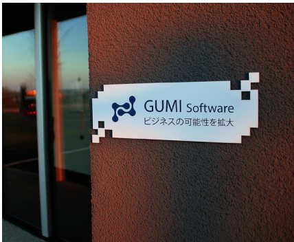
POP displays and sign engraving