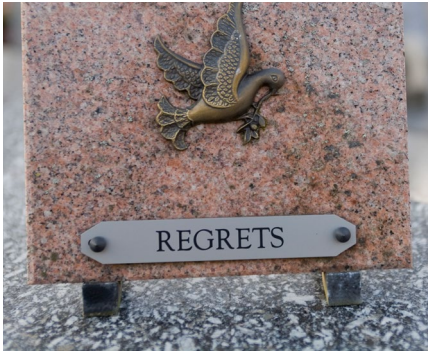
Funeral plaques and headstones engraving