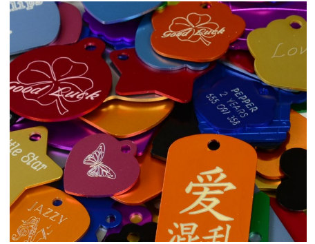
Pet and dog tags engraving