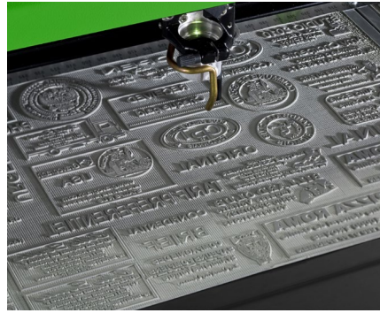
Engraving & laser cutting of custom ink stamps