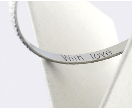
Personalising and engraving jewellery