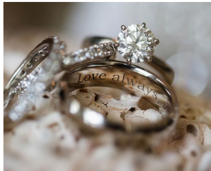
Personalising and engraving jewellery