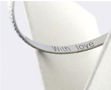
Personalising and engraving jewellery