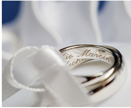
Personalising and engraving jewellery